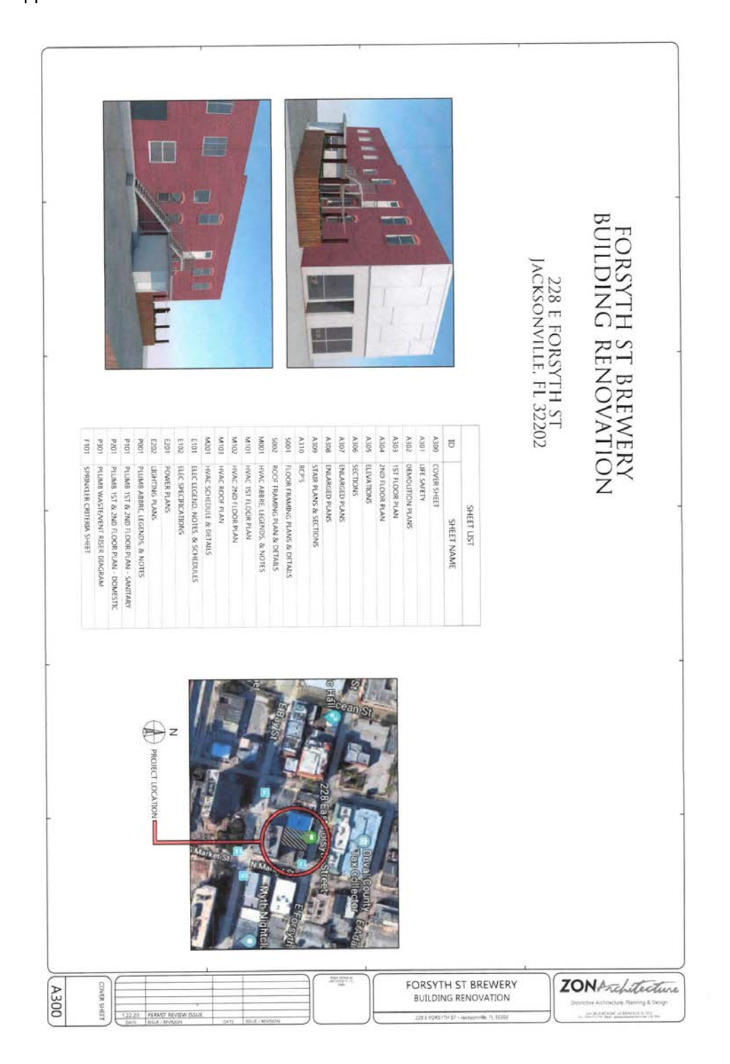
EXHIBIT A: Design for Storefront and Interior Application Score